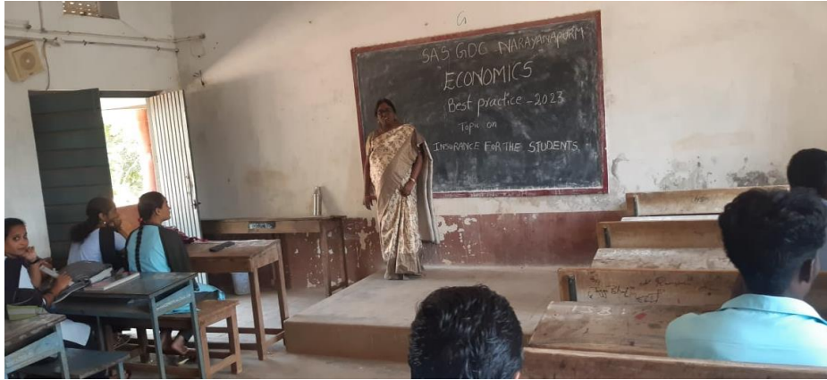
Staff explaining the importance of Insurance for Students