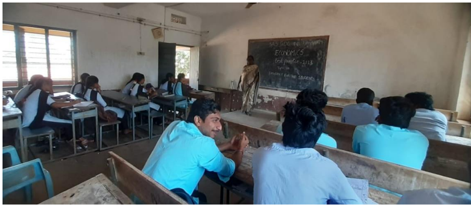
Students discussing among themselves on the comprehensive plans