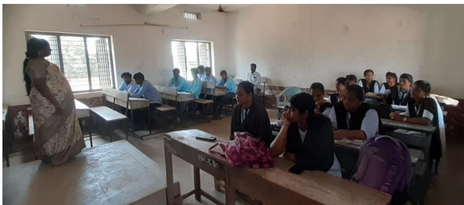
Students after enrollment for insurance